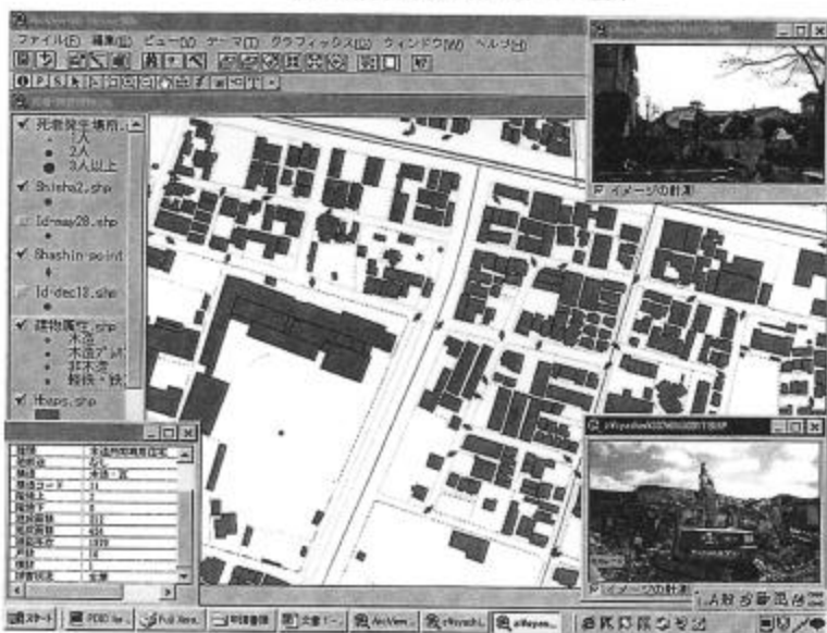
図 2-1 西宮市 Built Environment データベース