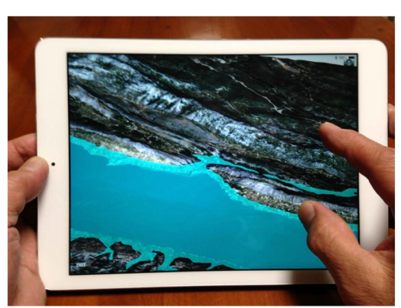
図1. iPadによるGeo-Sim の操作