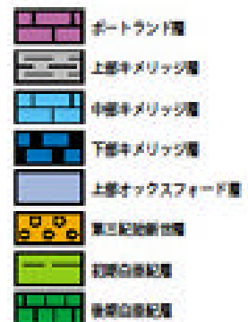
シャビニョールからサンセールを経て、プイ・シュル・ロワールに至る、ジュラ紀地層のつくるケスタ地形の断面図。C. Pomero編「フランスのワインとワイン生産地域」およびM. Broadley著「テロワール」の原因をもとに作成した。