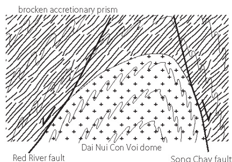
Moetamorphic dome model

ドームや正断層の上盤にあるカバー堆積物は、カンブリア紀から白亜紀まで順次重なる正常層ではない。基底不整合も保存されている白亜紀の赤色層を除いて、すべて付加体由来と考えられる。膨大な量の石灰岩や玄武岩の分布は例えば、三疊系として、マッピングされているが、遠洋性チャート、アンバー、半遠洋性多色泥岩など、付加体を特徴付ける岩石を、ベトナムで初めて発見した。例えばデボン系とされているタービダイトは海溝充填堆積物で、多くは海洋性岩石からなるブロックの基質をなすと考えられる。ただし、付加帯形成時の構造はほぼ消失していて、これらカバー堆積物の構造はドーム変成岩の構造と、大差ない。つまり、中新世の変形は、古期のカバー堆積物にも強く及んでいる。なお、化石産地は従来の地質図に多数記されているが、筆者らは1地点でペルム紀フズリナ化石を発見したに留まっていて、これは付加体であることに加えて、強烈な中新世変成作用を反映している。