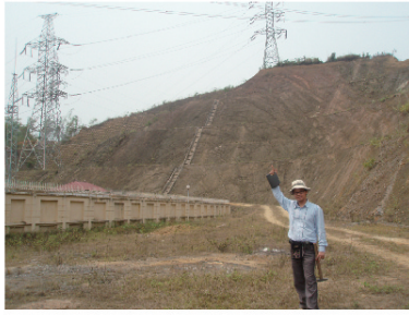
Miniature of metamorphic dome Anticlinal fold accompanies axial planar cleavages, dextral stretching lineations, and parasitic folds

Keywords: Northern Vietnam, metamorphic dome, D1 trans pression, dextral, D2 Red River normal fault, accretionary prism origin