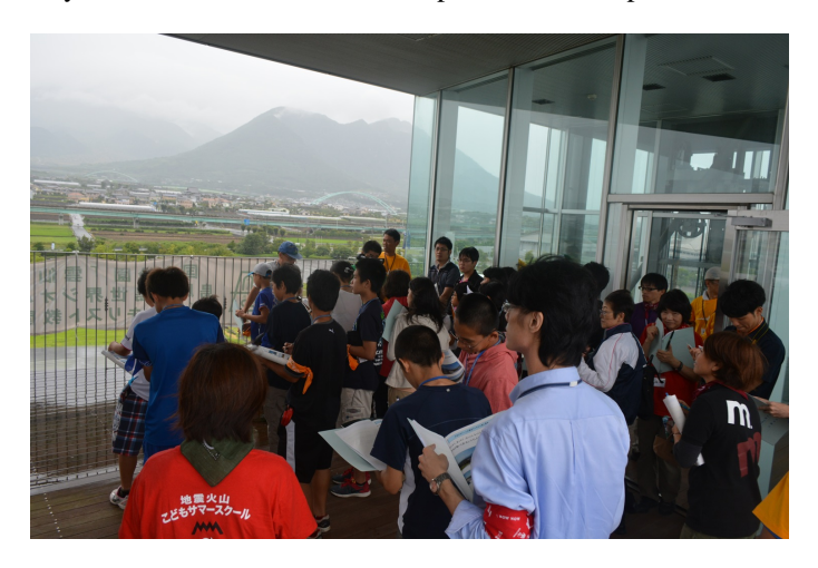
Keywords: Education for disaster-prevention, Geopark, Shimabara Peninsula

We will report this program, the secrets of Kyushu which were discovered by Children, and achievements of the children's summer school on earthquakes and volcanoes in the presentation.