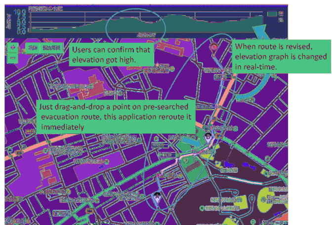
This application evaluate transition of elevation on users' detected route dynamically.