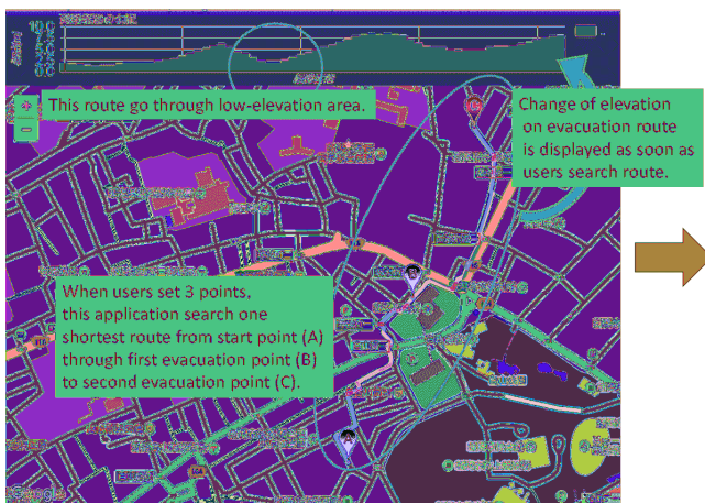
This application detect "Shortest Route" from start-point through 1 st goal to 2 nd goal.