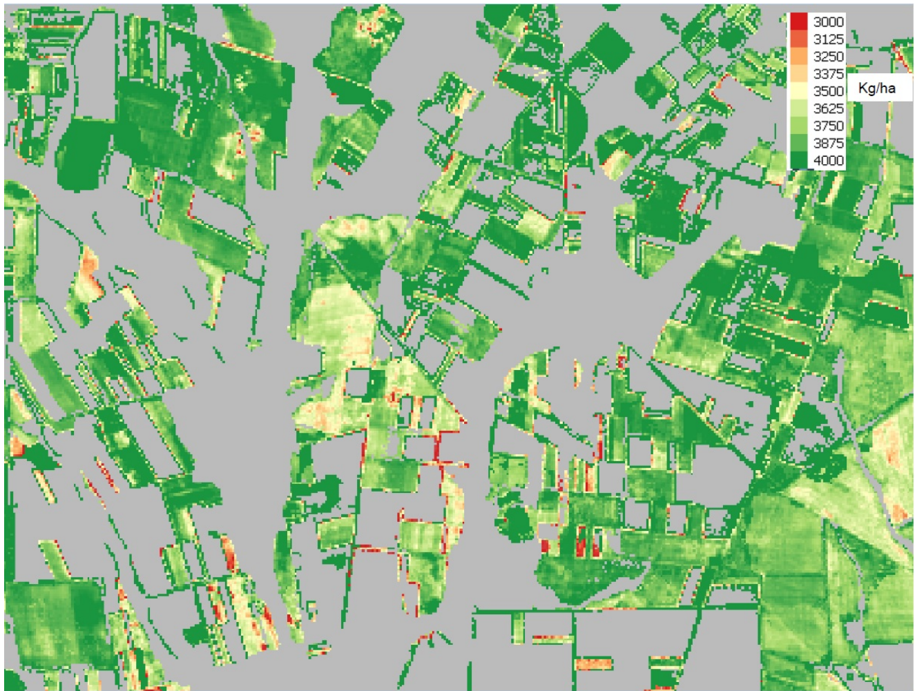
Winter wheat yield map derived from Landsat-8